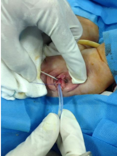
Figure 2. Placement of a catheter into the urinary bladder and vagina

After intraoperative injection of saline through the abdomen, the vaginal septum was evaluated from the outside. It was revealed that the vagina is closed and a lump was created from the vaginal septum from the outside. After aspiration and determination of the small thickness of the septum, cruciate incision was made on the septum and a Foley catheter was inserted. Three days after the surgery, the patient was discharged in good general condition.