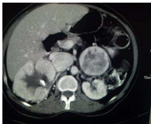
Figure 1b: CT scan of the abdomen in the presented case (sagittal cut-off) with contrast

Results of 24-hour urine collection test are