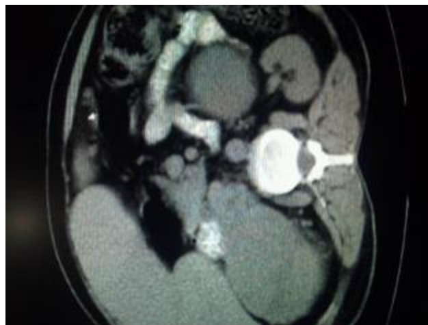
Figure 1a: CT scan of the abdomen in the presented case (sagittal cut-off) without contrast

Upper Gastrointestinal (GI) endoscopy and total colonoscopy were normal. Computed tomography (CT) scan demonstrated masses in both adrenal glands with diameters of 6 and 12 cm (Figures 1a and 1b).