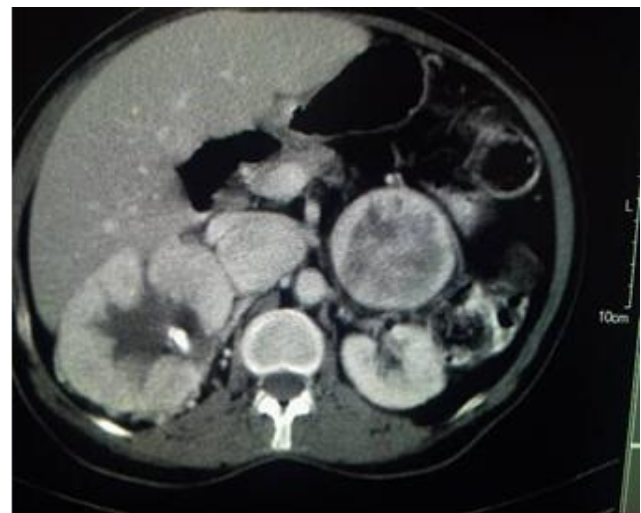
Figure 1b: CT scan of the abdomen in the presented case (sagittal cut-off) with contrast

Results of 24-hour urine collection test are