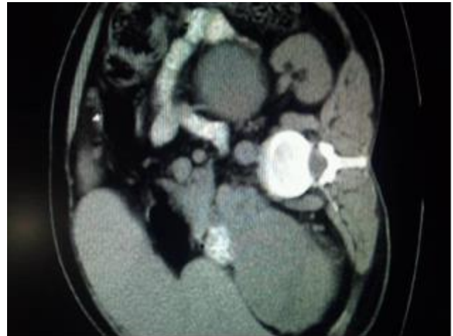
Figure 1a: CT scan of the abdomen in the presented case (sagittal cut-off) without contrast

and elevated erythrocyte sedimentation rate. Urinalysis and stool exams were normal. The patient had normal renal and thyroid function. In addition, levels of sodium, potassium, calcium, phosphorus, and alkaline phosphatase were normal. Upper Gastrointestinal (GI) endoscopy and total colonoscopy were normal. Computed tomography (CT) scan demonstrated masses in both adrenal glands with diameters of 6 and 12 cm (Figures 1a and 1b).